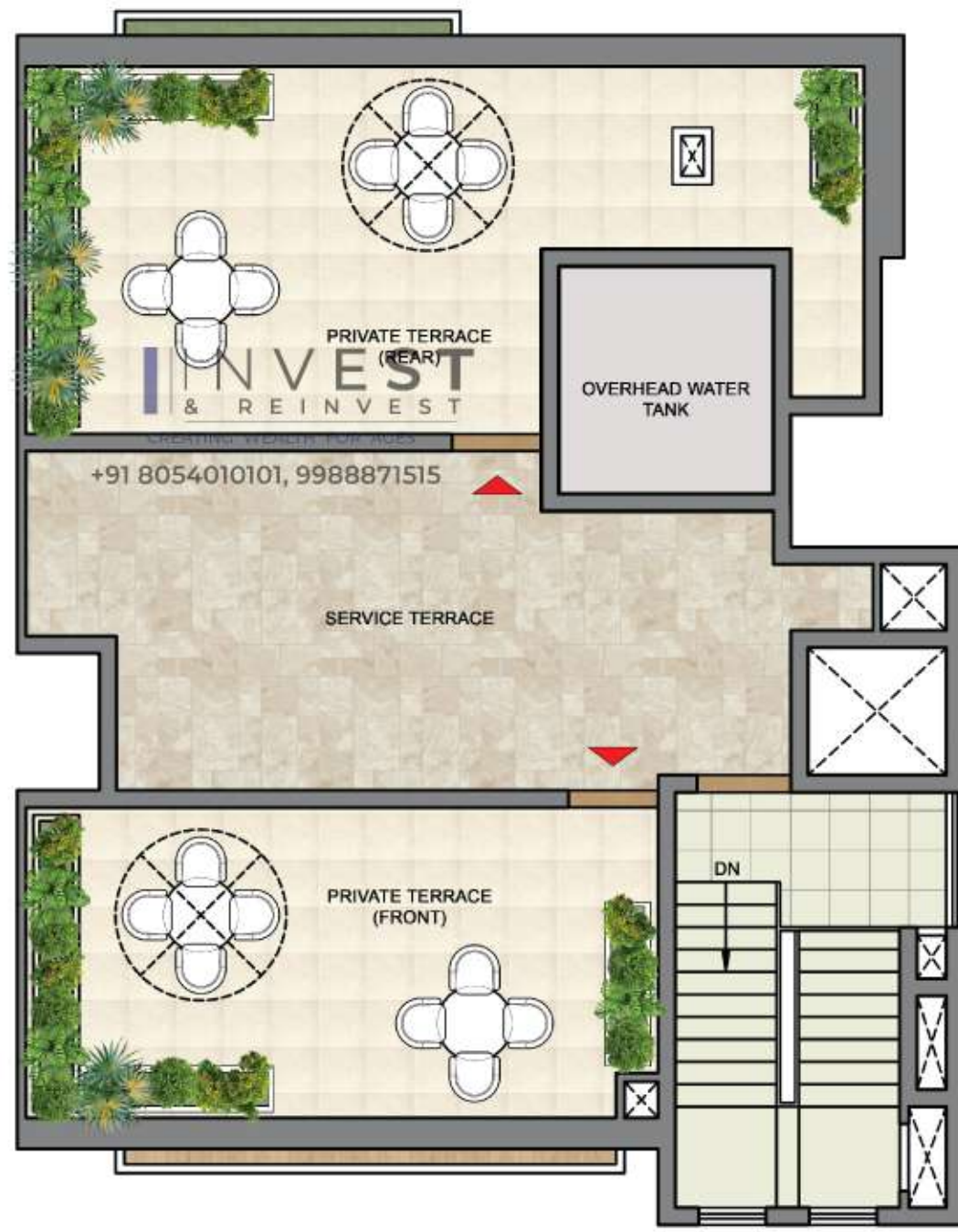
VILLA FLOORS TERRACE PLAN CORNER UNIT