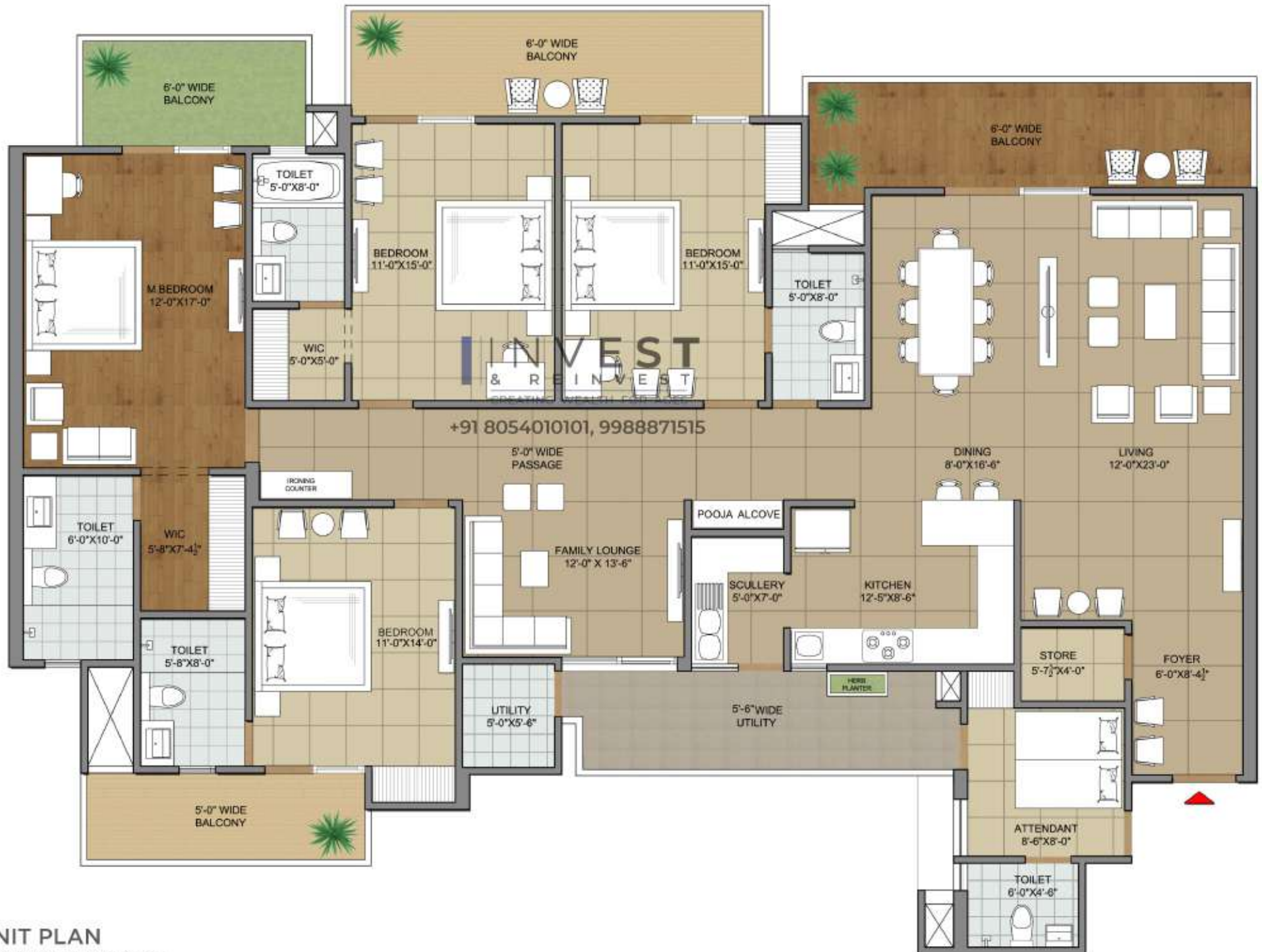
TYPICAL UNIT PLAN 4 BHK + ATTENDANT + LOUNGE AREA : 3,400 sq. ft.