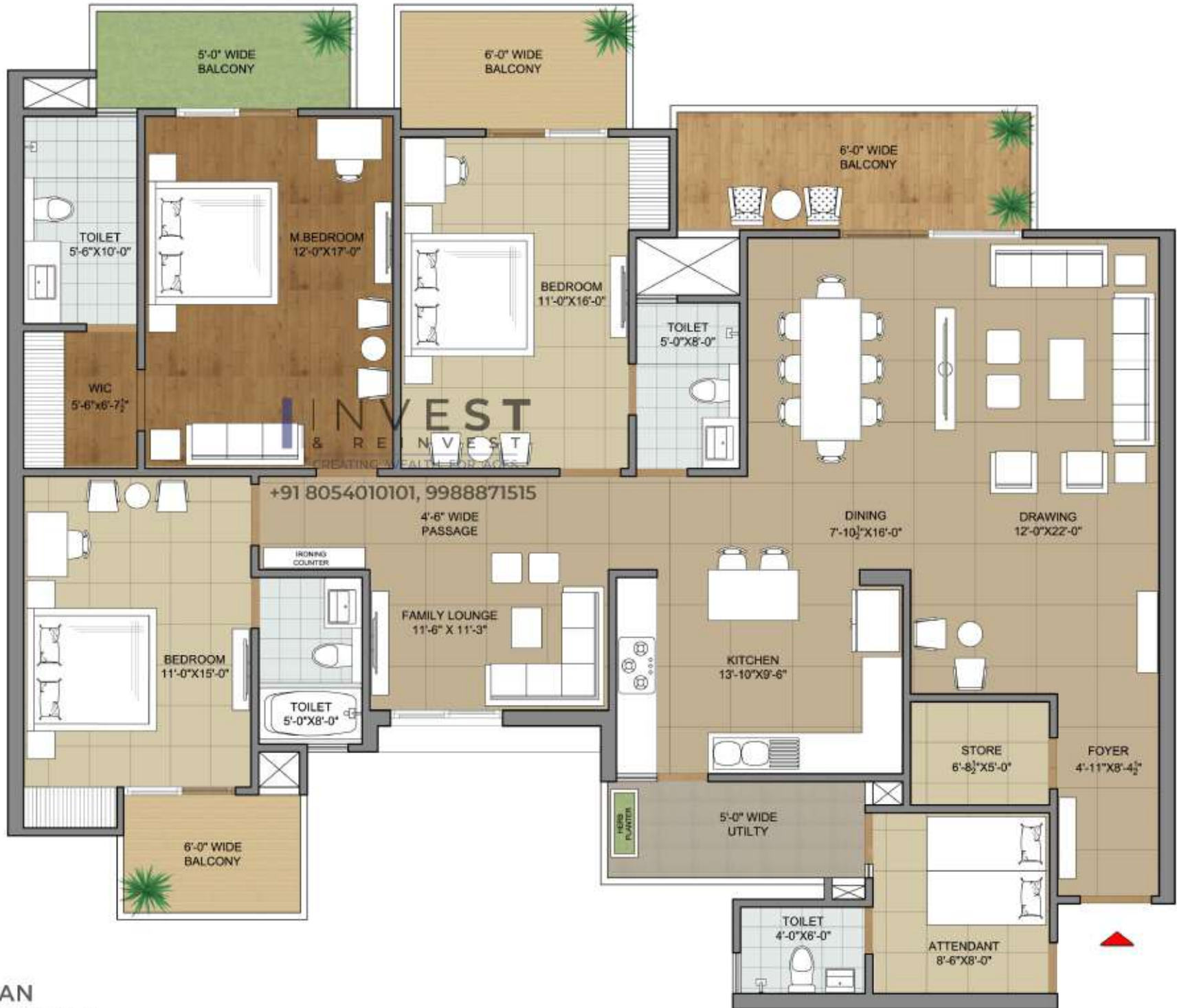
TYPICAL UNIT PLAN 3 BHK + ATTENDANT + LOUNGE AREA : 2,800 sq. ft.