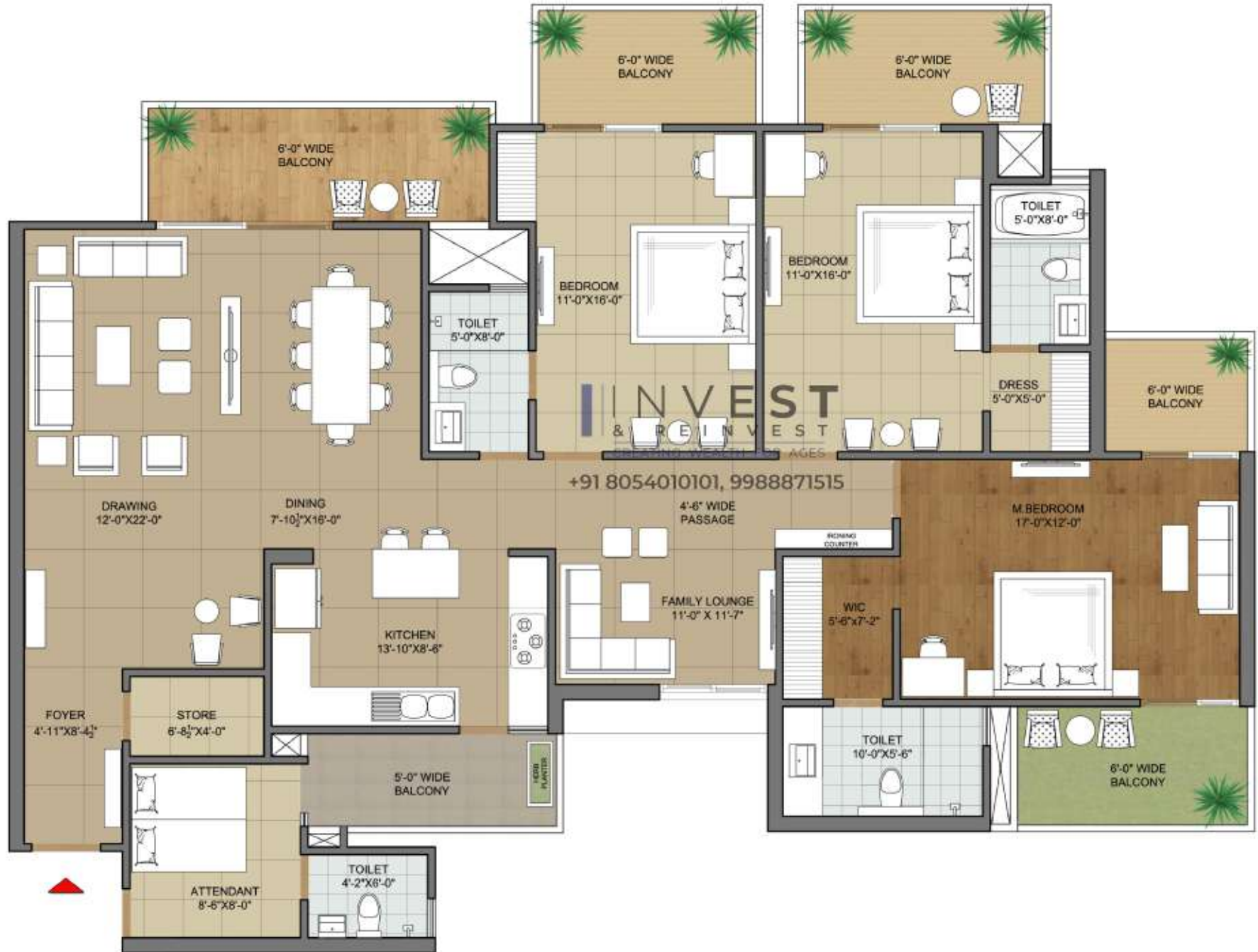
TYPICAL UNIT PLAN 3 BHK + ATTENDANT + LOUNGE (Type-2) AREA : 2,815 sq. ft.