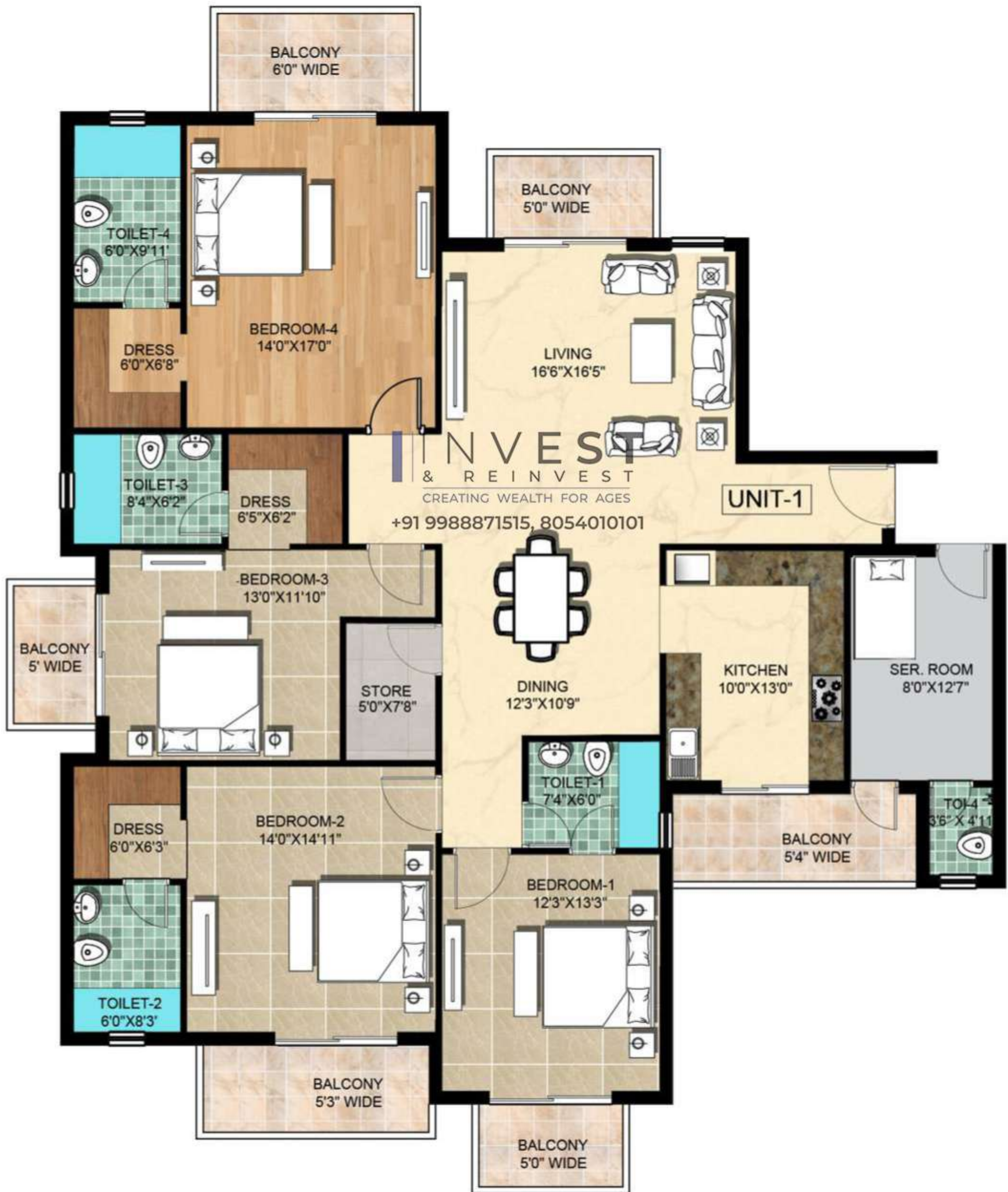
AREA BREAKUP (APP.)